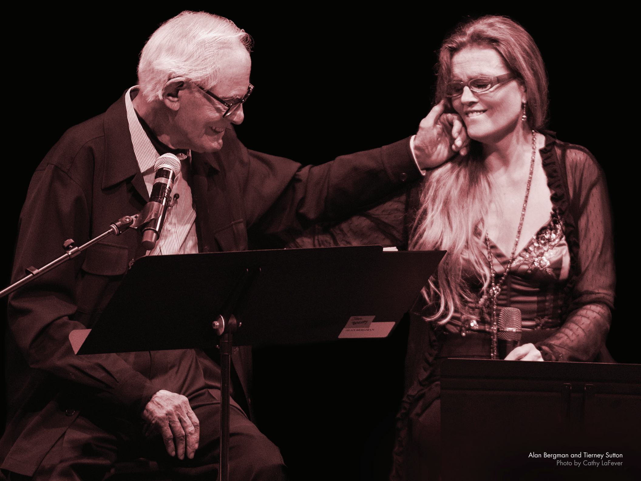
Alan Bergman and Tierney Sutton